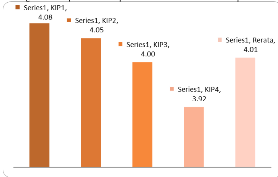
Figure 2. Respondents Response To Public Information Openness