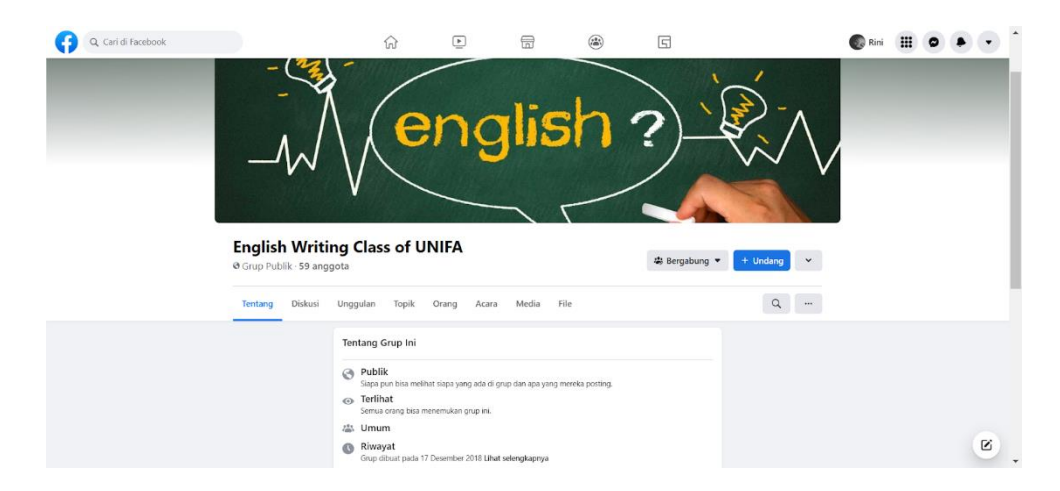
Figure 2 Facebook group landing page